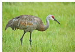
Sandhill Cranes are game birds, but coastal areas primarily in the northern half of Texas are closed to hunting sandhill cranes.