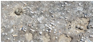
Wilson's Plover nest (left) and Least Tern nest (right). Scrape nesters like these scrape dents in the ground to nest. These nests can be hard to see and are especially vulnerable to humans and dogs.

• Penalty: Class C misdemeanor. Port Aransas Code of Ord. § 18-240(a).