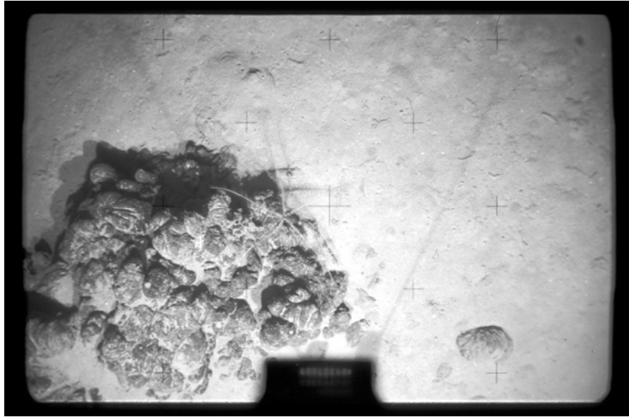
Figure 7.1. Hillock of added asphalt on the soft abyssal floor on which a crinoid, a colony of hydroids and coral branches are growing.